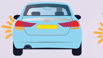
向左駛出或轉左 Move out to the left or turn left

During driving, use direction indicators in good time before changing lanes, overtaking or making turns at junctions to indicate the intention of vehicle to other road users. Always be sure that the direction indicator is cancelled after a manoeuvre.