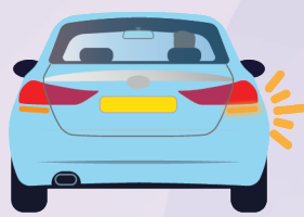
向右駛出或轉右 Move out to the right or turn right