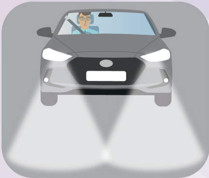
低燈 Dipped Lights