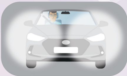
高燈 High Beam Lights