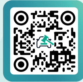
掃描瀏覽專題網站 Scan to visit the thematic website

由2025年2月起，普通車輛登記號碼將會透過「拍牌易」網上平台進行拍賣。 Online auction of ordinary vehicle registration marks through E-Auction platform to start from February 2025 .